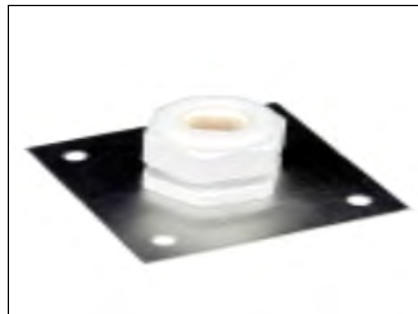
Insulation entry kits

Fastening Tape & Clamp for fixing the heating cable, and for mounting the bracket