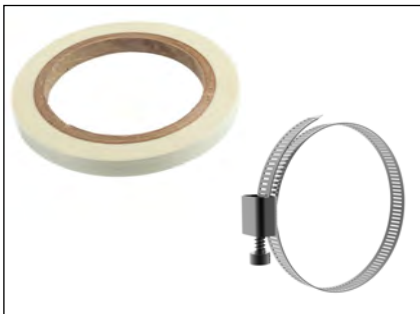
Fastening Tapes & Clamp

Fastening Tape & Clamp for fixing the heating cable, and for mounting the bracket